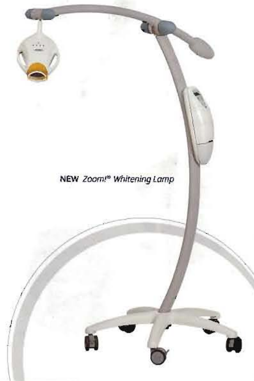
NEW Zoom!® Whitening Lamp

A: During the procedure, patients may comfortably watch television or listen to music. Individuals with a strong gag reflex or anxiety may have difficulty undergoing the entire procedure.